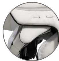
CURVED ELITE GRIP AND PROTECTION.