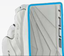
585 WITH BINDING