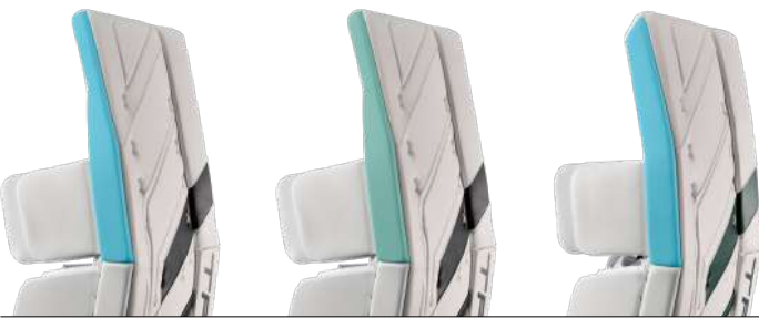
THIN XTRA STIFF