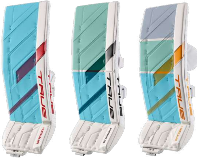
NO BREAK CORE THIN STIFF THIN XTRA STIFF THICK MID STIFF