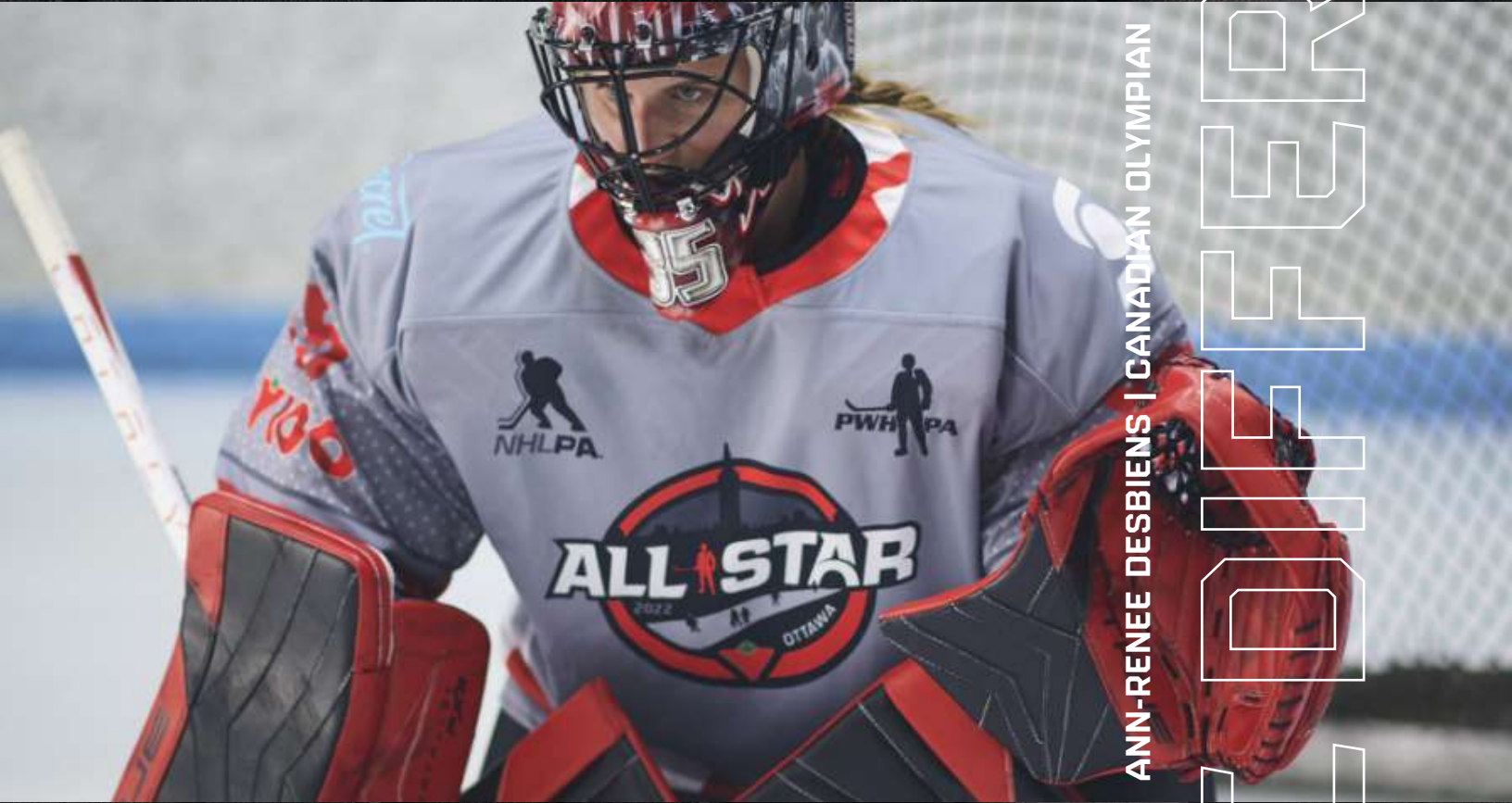
ANN-RENEE DESBIENS | CANADIAN OLYMPIAN