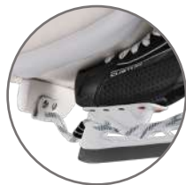
JEN PRO – HD FOAM WITH PUSH BUNGEE LACE