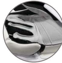
SUREGRIP PALM FOR STICK CONTROL, COMFORT AND DURABILITY