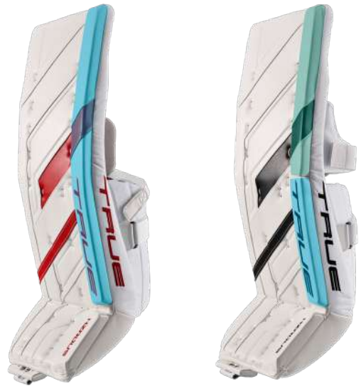
NO BREAK OUTER ROLL STIFFER PAD TO PROVIDE A SOLID SEAL TO THE ICE