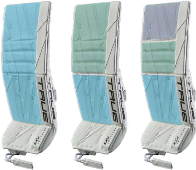
NO BREAK CORE THIN STIFF THIN XTRA STIFF THICK MID STIFF