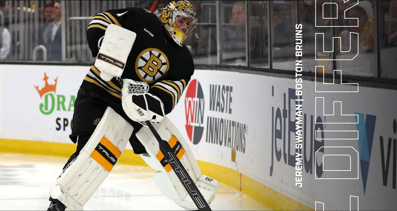
JEREMY SWAYMAN | BOSTON BRUINS