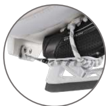
JEN PRO – HD FOAM WITH HYBRIDE BUNGEE LACE