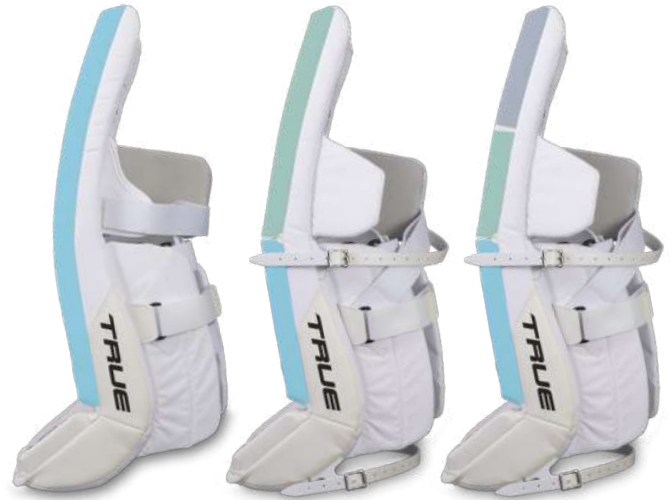
NO BREAK OUTER ROLL