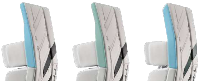
THIN XTRA STIFF