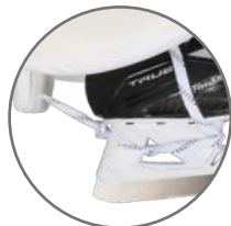
JEN PRO – HD FOAM WITH SKATE LACE