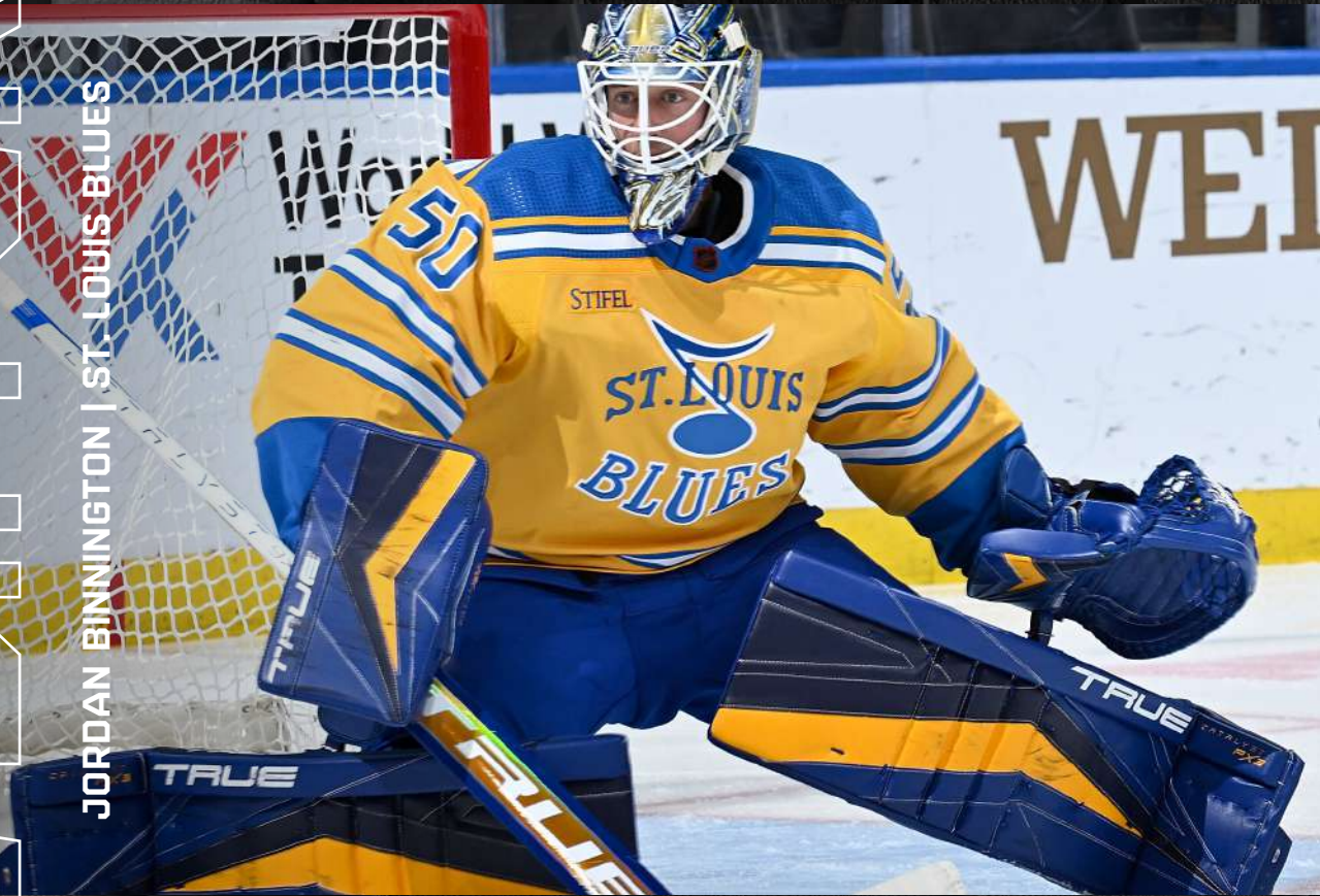
JORDAN BINNINGTON | ST. LOUIS BLUES