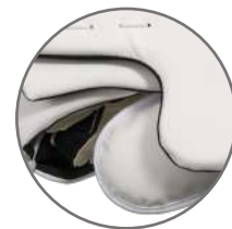
STRAIGHT CLOSER TO THE STICK SHAPE FOR A BETTER SEAL.