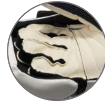
NASH PALM BE CLOSER TO THE STICK AND MORE FLEXIBLE PALM