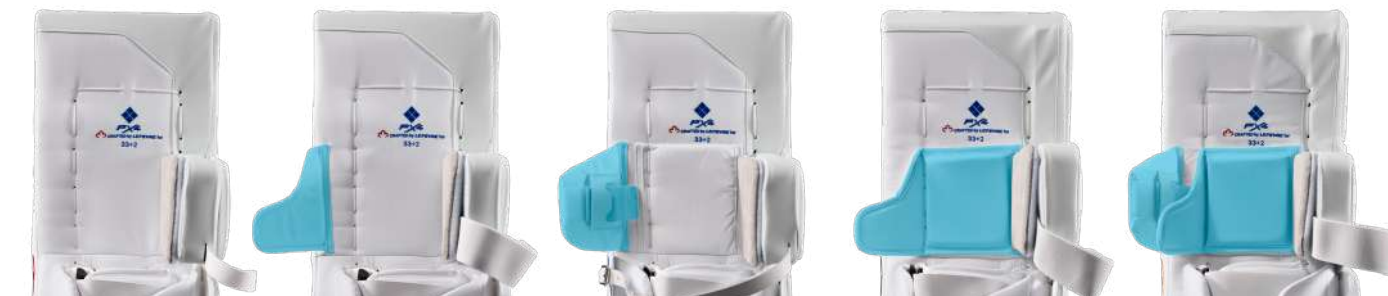
RECESSED (NO KNEE WRAP)